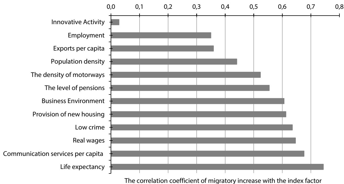
Fig. 3. Rating of the significance of the territory attractiveness characteristics for the regional type with the rational behaviour of migrants